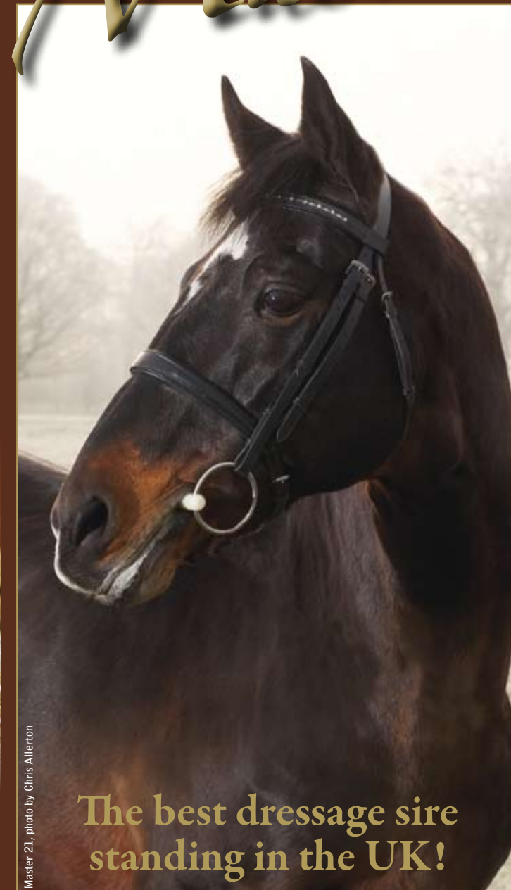
Master 21

The best dressage sire standing in the UK!